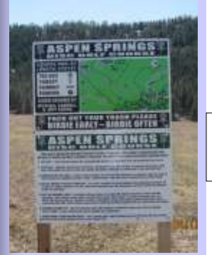
Disc Golf Anyone?